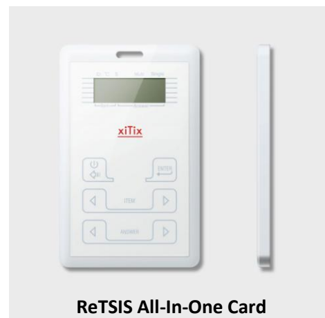
ReTSIS All-In-One Card

The system acts wireless inside the classroom and transmits data using the available Local Area Network (LAN).